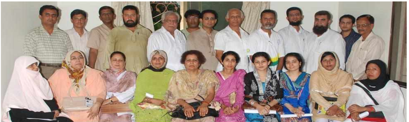
Members of Ilm-o-Amal Association - Annual Meeting July 25, 2009 Karachi